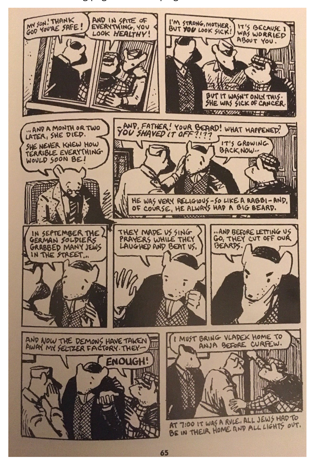
Task 1: Read the following page from Art Spiegelman's "Maus".