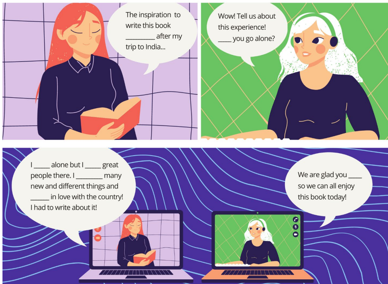
Comic strip 5

TASK 3: Now look at the comic strip below (comic strip 5) and try to fill the blanks, using the verbs above in the past tense.