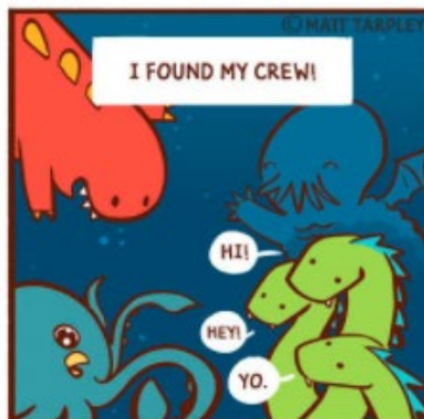
Comic strip 3