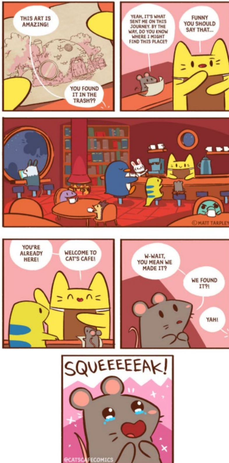
Comic strip 2