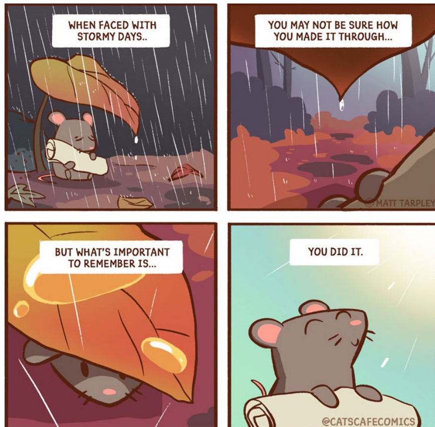
Comic strip 1

TASK 1: Read the following comic strips 1, 2 and 3