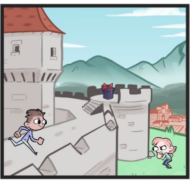
Créé avec l'application Not développée par la {BNF