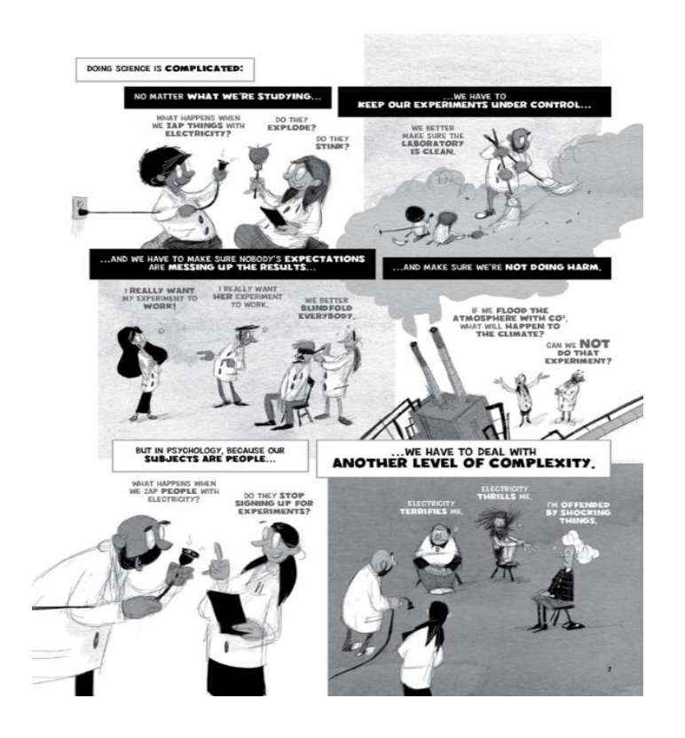
Image 2 – page from "The Cartoon Guide to Science" by Larry Gonick

Thus, comics for pupils with SLDs should be conceived in specific ways in order to provide a clear structure and help these learners represent key notions of a lesson in more visual ways. In this context, adaptation to comic materials can be made in the below areas: